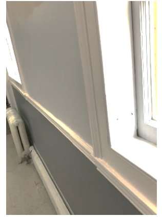
In progress: Wall, wainscot, and trim colors get a test

Physical improvements include: Restored and painted walls, windows, baseboard heaters, and cabinets; New high-traffic vinyl flooring; and re-sized and repurposed pews to line the perimeter of the room.