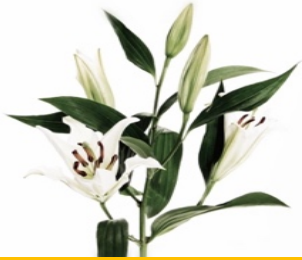
Virtual Lilies Project

Due to the corona virus pandemic, we are extending the time to donate to One Great Hour of Sharing and Virtual Lilies (Toni's Kitchen) to Friday, May 8th .