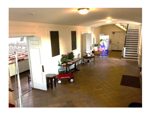
Entry hall with two double-doors to sanctuary.