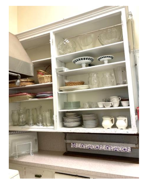
Pitchers, punch bowls, etc.