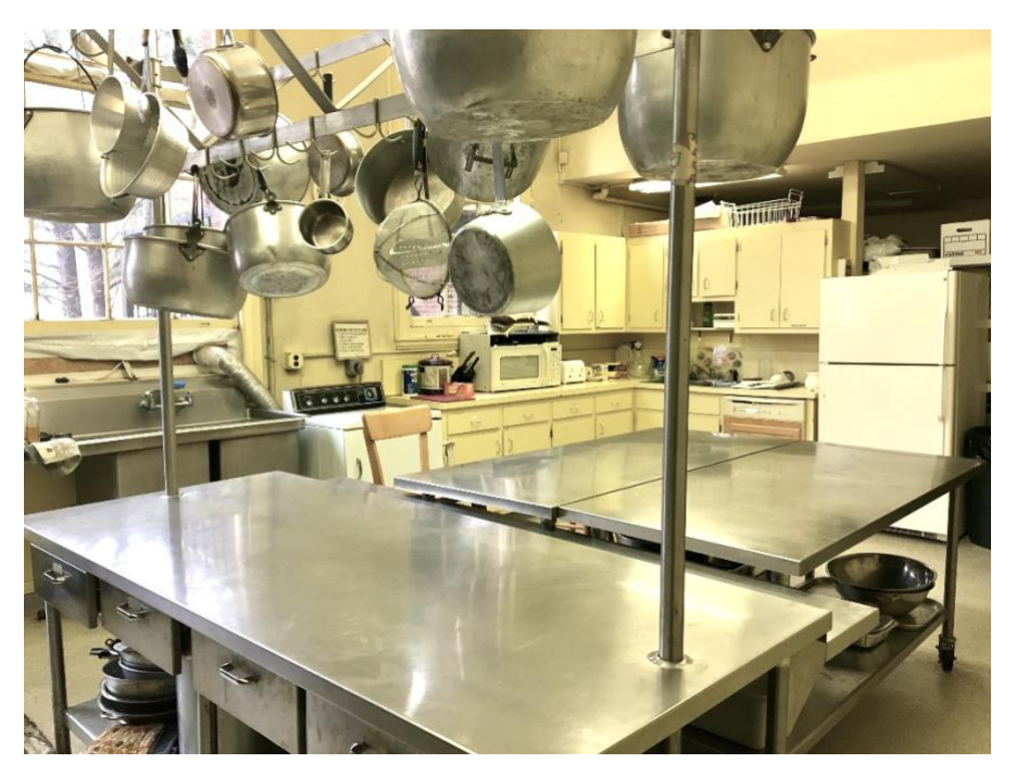
The prep space can accommodate multiple cooks and servers.