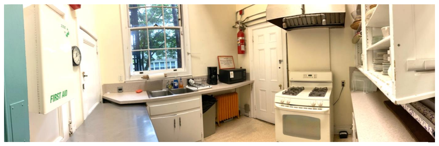
The kitchenette is on our main floor, ideal for use with the Community and Fellowship Rooms or Nursery.

Features stovetop, oven, sink, microwave, small prep space, refrigerator and limited serving ware.