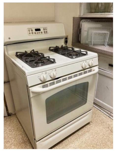
Four-burner gas stove and oven.