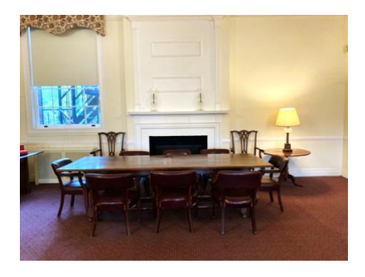
Large table for meeting/ buffet. Can be moved to meet your needs.