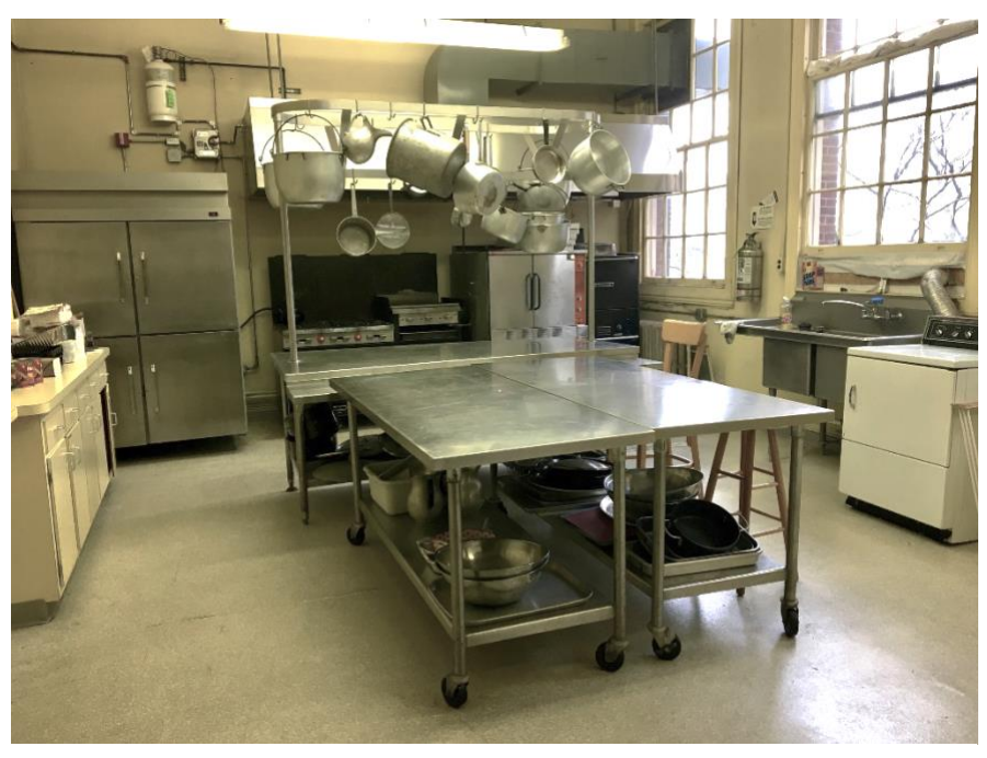
The spacious kitchen is on our second floor, two steps from Grace Hall.

Features industrial stove, prep space, industrial fridge, refrigerator, double sink, coffee maker, washer and dryer, serving window, storage